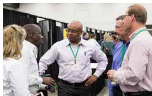
◀ Diverse companies and Superior Maintenance Company, a Toyota Tier I Supplier, networking