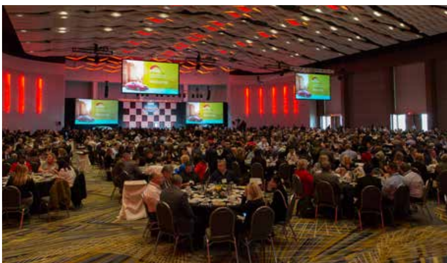
▲ OE Luncheon program