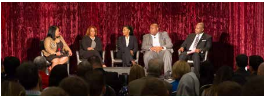
▲ Real Talk from the Automotive Industry Panel